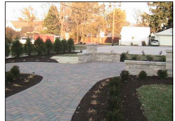
ROACHDALE COMMUNITY GARDEN 2006