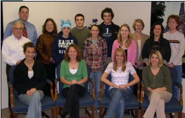
YOUTH PHILANTHROPY COMMITTEE 2008

The Foundation's endowment, more than $20 million in assets, is a pool of more than 174 individual funds established by donors. The endowment is permanent; granting is based on earnings and market growth. We are good stewards of our endowment and receive professional investment advice from Oxford Financial Group. As a result, our investment returns are much higher than average for an endowment of our size. Investment returns since inception have averaged nearly 9% annually.